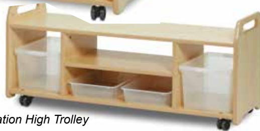
4 Station High Trolley