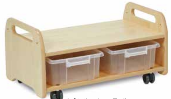
2 Station Low Trolley