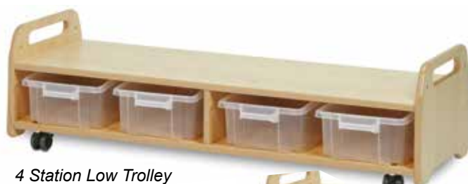
4 Station Low Trolley