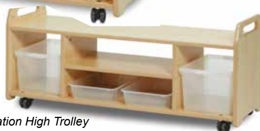
4 Station High Trolley