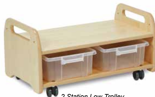
2 Station Low Trolley